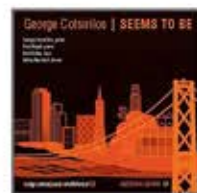
SEEMS TO BE