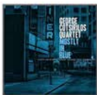
MOSTLY IN BLUE