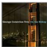
ON THE REBOB